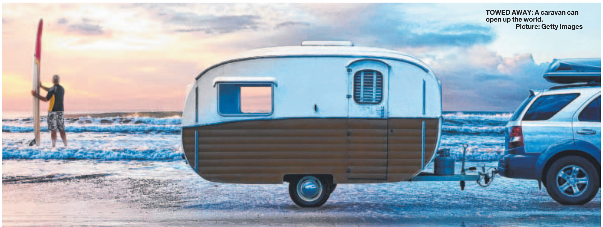
TOWED AWAY: A caravan can open up the world.

the home and generally suit families with kids as they can sleep separately from their parents," Yates says. "Caravans tend to be larger and more expensive, depending on the model you choose. "We find older couples tend to opt for caravans over camper trailers as they are easier to set up and provide